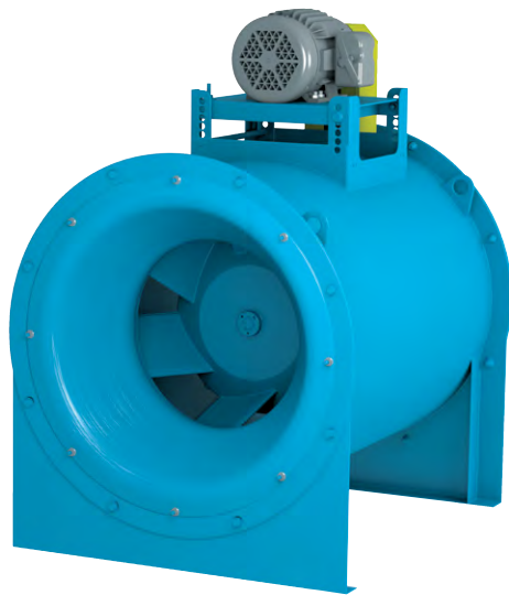
Model QSL Mixed Flow Fans