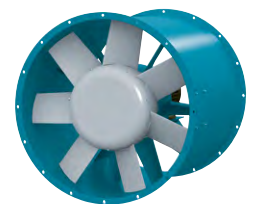
Model TCVX Vaneaxial Fans