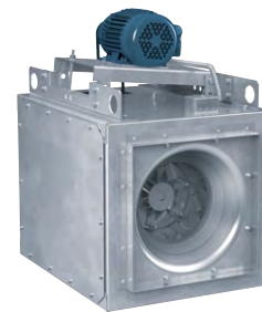
Model BSI Inline Centrifugal Fans